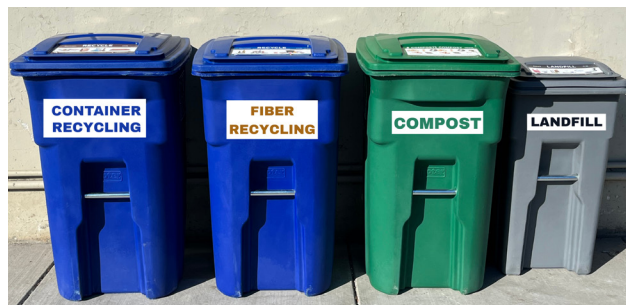
Note: Berkeley has two bins for recycling — one for containers and one for fiber (cardboard/paper).

When recyclable and compostable materials break down in a landfill, they produce methane, a potent greenhouse gas that contributes to climate change. To respond to the climate crisis, State law SB 1383 requires all businesses, nonprofits, institutions, and multifamily properties (5+ units) to: